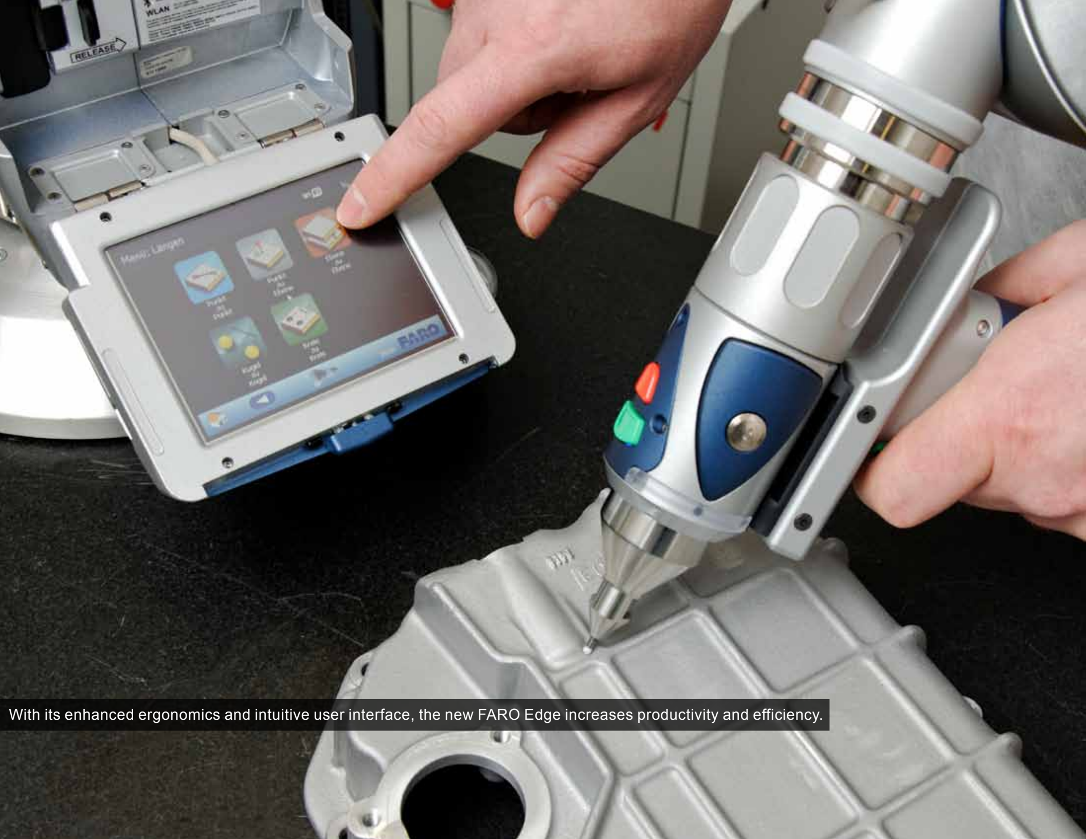
With its enhanced ergonomics and intuitive user interface, the new FARO Edge increases productivity and efficiency.