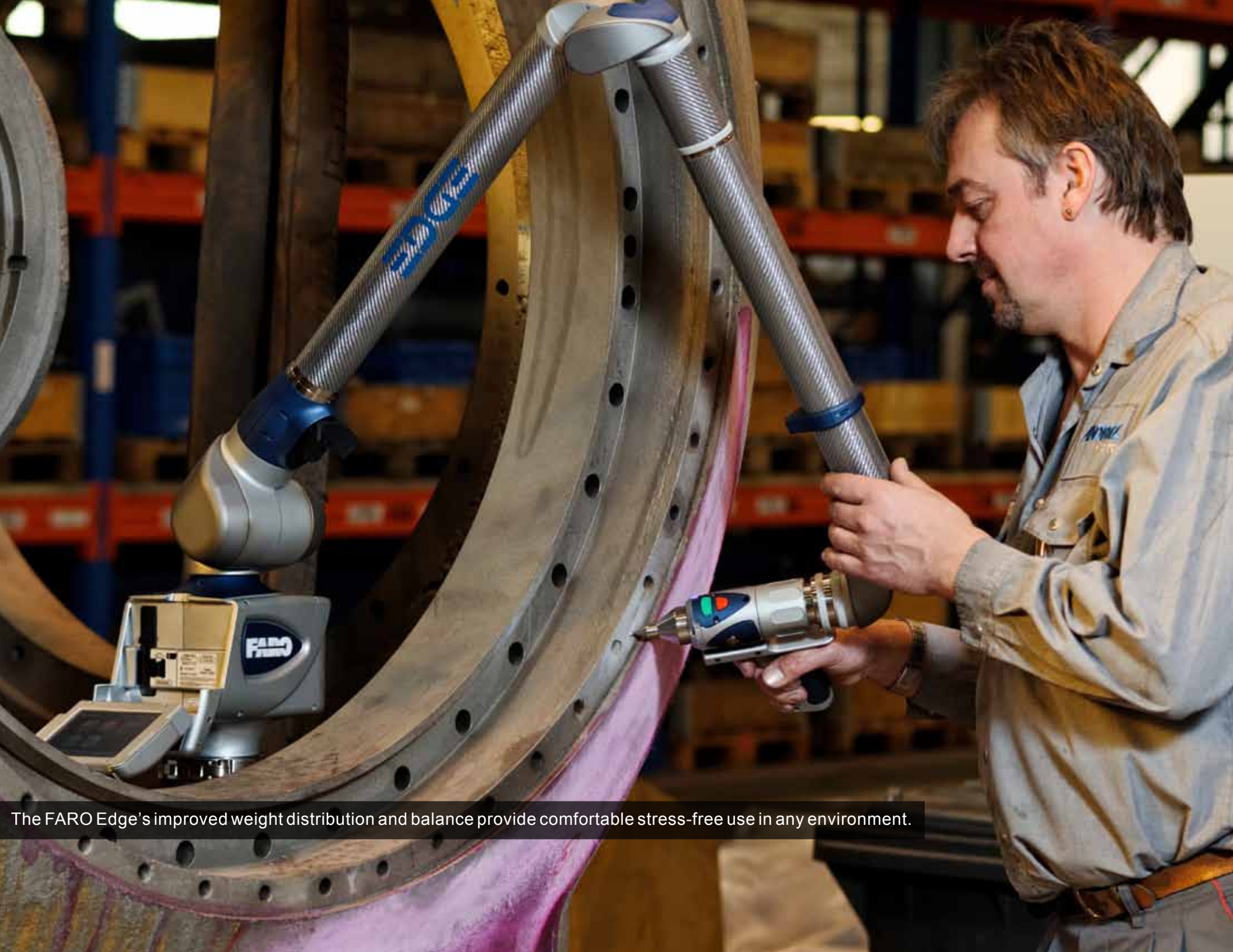
The FARO Edge's improved weight distribution and balance provide comfortable stress-free use in any environment.