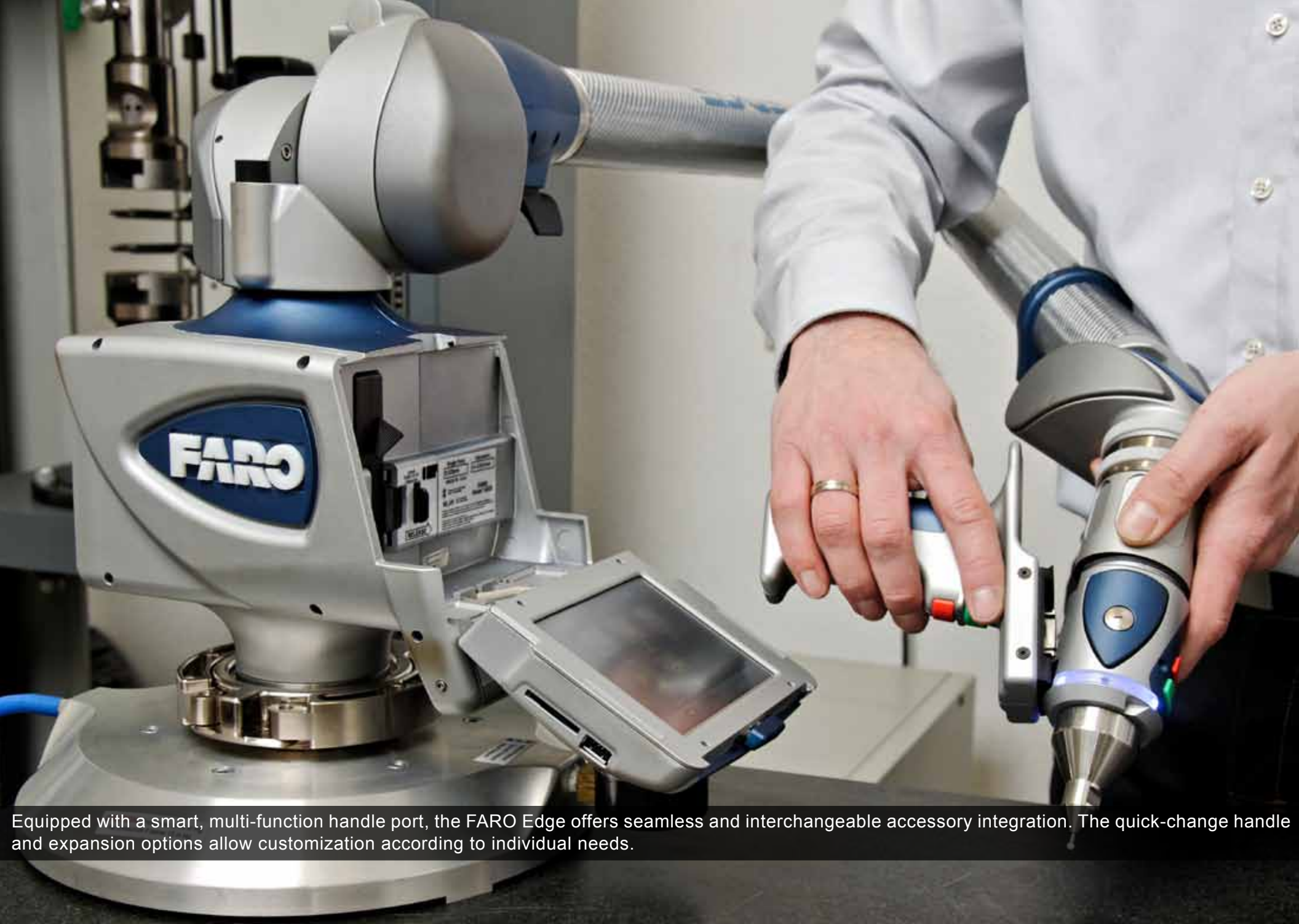
Equipped with a smart, multi-function handle port, the FARO Edge offers seamless and interchangeable accessory integration. The quick-change handle and expansion options allow customization according to individual needs.